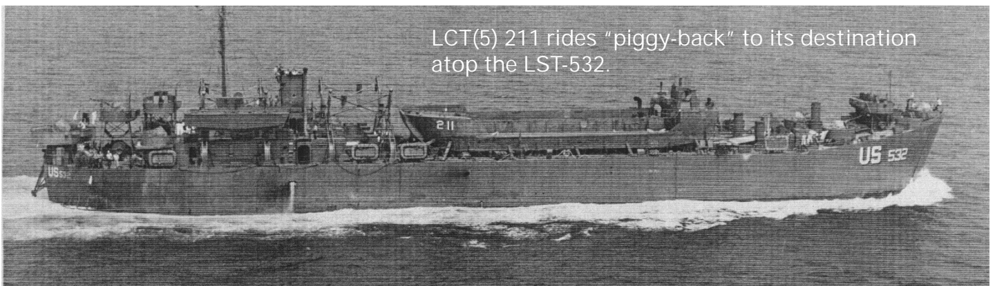
LCT(5) 211 rides "piggy-back" to its destination atop the LST-532.