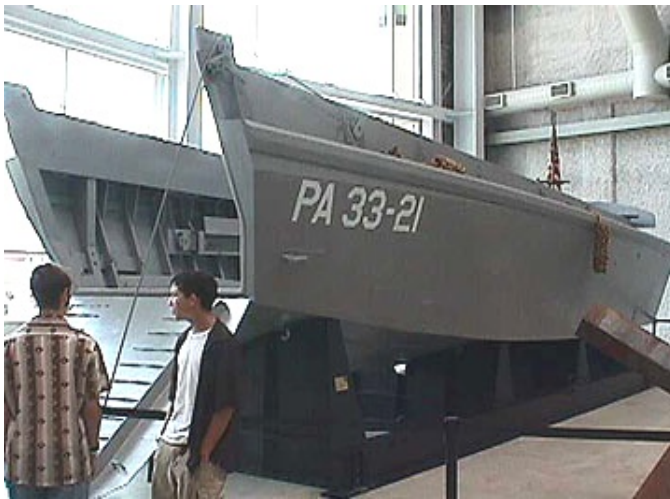
Prototype for the LCTs--A reconstructed Higgins Boat at the National D-Day Museum.